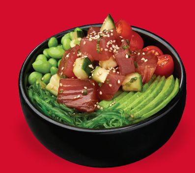
AHI TUNA POKE BOWI