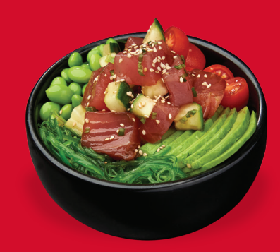
AHI TUNA POKE BOWI